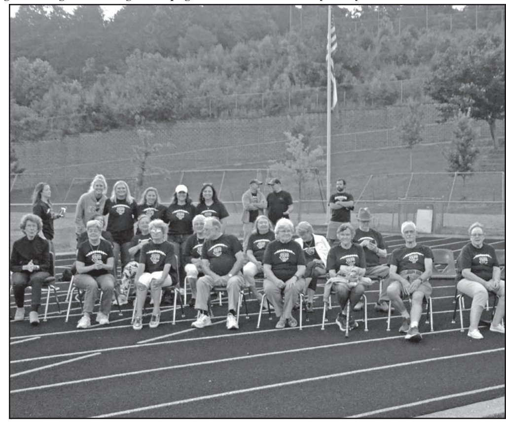
Hiawassee Park Senior Living Community Center residents enjoyed a special invite to watch the first home game of the season at TCHS.